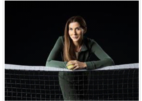
Monica Seles and argenx myasthenia gravis awareness partnership