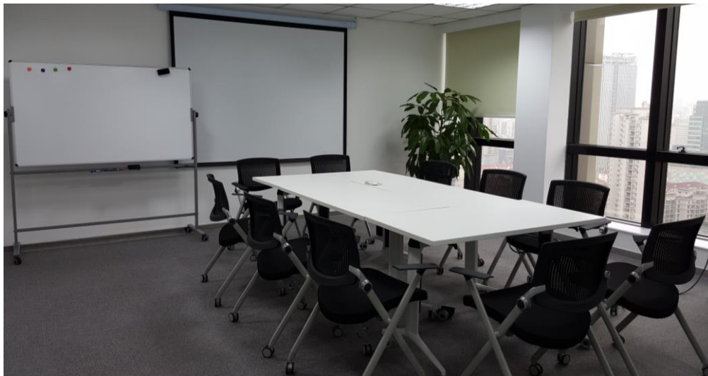
View of Conference Room