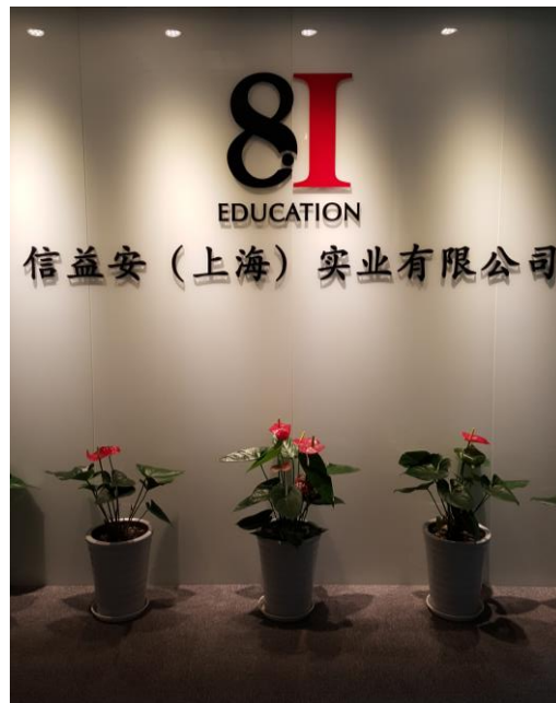
View from the main entrance of 8I Shanghai office