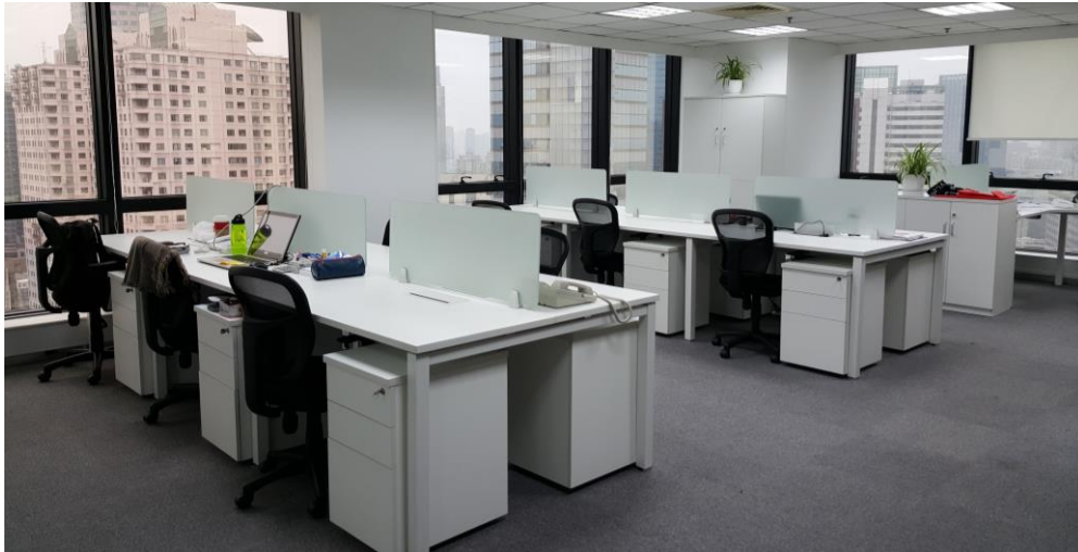
8I Shanghai's Office Workstations