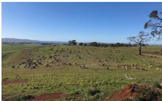
Figure 5: Sheep grazing on rehabilitated land after mining at the Bald Hill bauxite mine, Tasmania

ABx endorses best practices on agricultural land, strives to leave land and environment better than we find it.