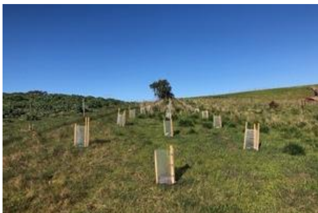
Figure 4: Tree windbreak at Bald Hill bauxite mine, Tasmania, planted in Spring on rehabilitated land