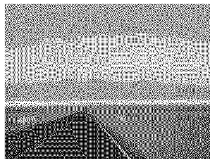
Road to Salar Olarez