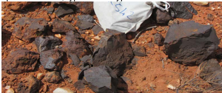
Figure 3. Sample MBCR542, typical rock type of massive hematite

Figure 2 shows the prominent hillside topography of the Hematite outcrop in the background. The body has substantial width up to 60m in places and dips below surface at variable angles from 30 to 70 degrees. Accurate average widths cannot be calculated until drilling is completed and dip is determined.