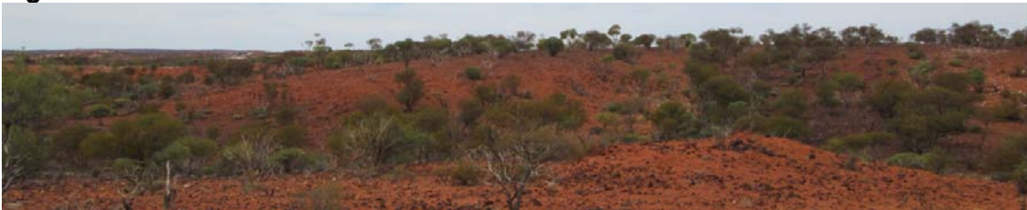
Figure 2. Tabaroa South

Figure 2 shows the prominent hillside topography of the Hematite outcrop in the background. The body has substantial width up to 60m in places and dips below surface at variable angles from 30 to 70 degrees. Accurate average widths cannot be calculated until drilling is completed and dip is determined.