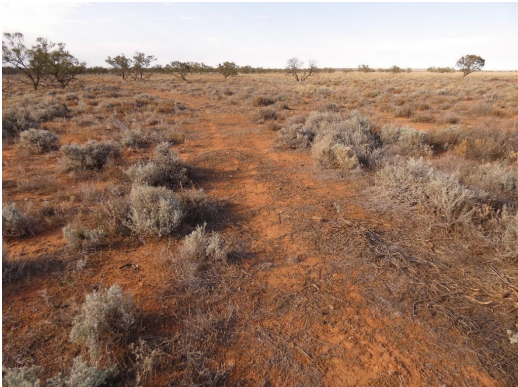
East Borehole Drill Site EB2