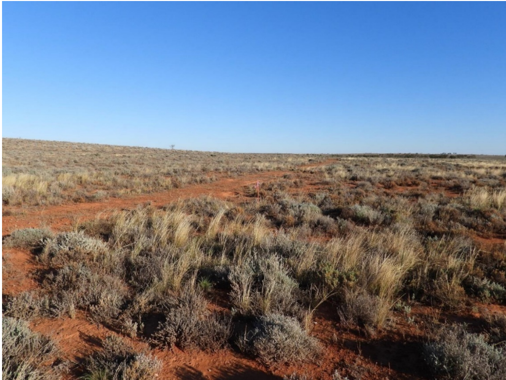
East Borehole Drill Site EB1