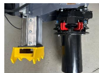
Fig 3. 115-203mm CKS module