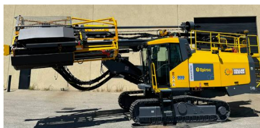
Fig 2. TBS Auto CKS rig – Epiroc T45