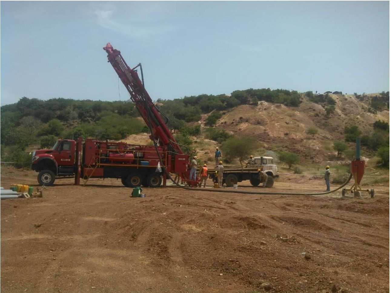
Photograph 1. First hole of the current RC drilling program (BARC131) commences at Banouassi