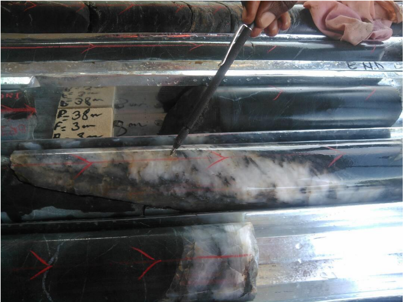
Photograph 2. Quartz veining in the first hole (BADH001) in Golden Rim's diamond drilling program at Kouri.