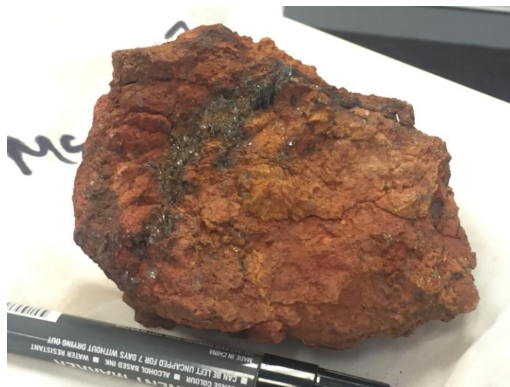
Figure 1: Photo of the rock chip from the Mary Springs North prospect.

Registered Office: Level 1, 8 Outram Street, West Perth, WA 6005, Australia