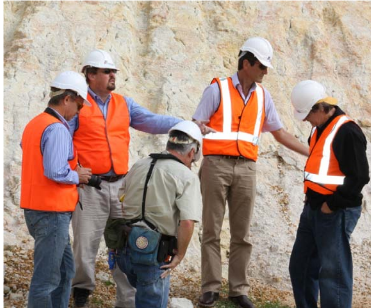
Figure 2: AMMG personnel and an American executive team at the Meckering project test pit.

AMMG believes that its kaolin resource may be able to accommodate a number of different product applications simultaneously, and is not confining itself to a sole focus on paper filler applications.