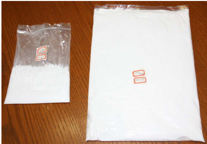
Figure 1: The samples of 99.99% high purity alumina (left) and 99% metallurgical grade alumina (right).

The lack of impurities in the raw kaolin is attributable to the ancient weathering processes on the Company's ground in the Yilgarn Craton. This weathering process has reportedly occurred over some of the oldest weathering in history. After approximately 180 million years of weathering, mineral elements of silica and alumina remain in a friable, powdery, whitish surface residue with logged thicknesses of up to 42 metres.