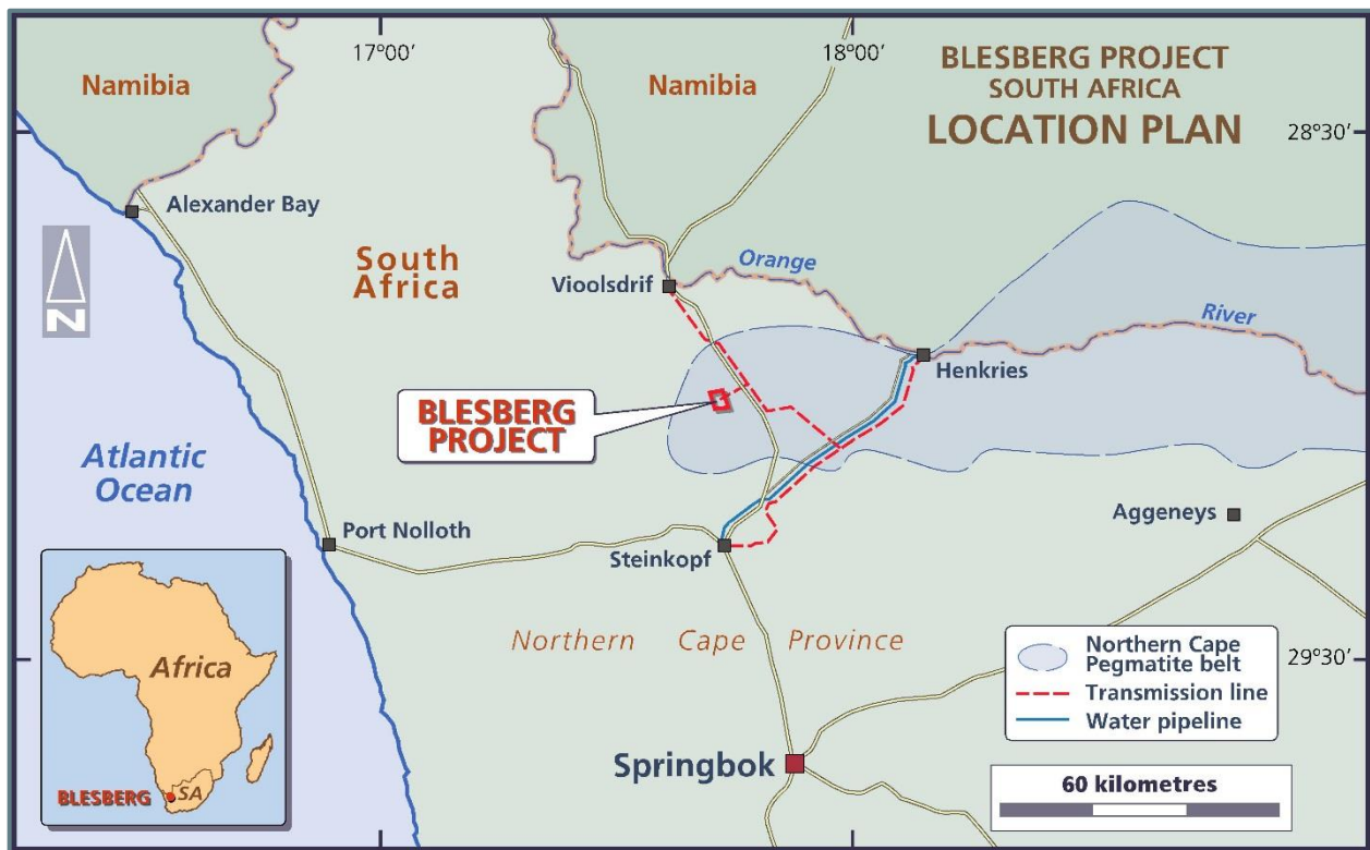
Figure 1 – Blesberg Lithium Project Location Map

Mining operations, which ceased last decade, have never exceeded a modest scale and as such no significant exploration drilling of the deposit and its depth potential has been undertaken. As with many other pegmatite fields globally, lithium was not considered in previous exploration and mining.