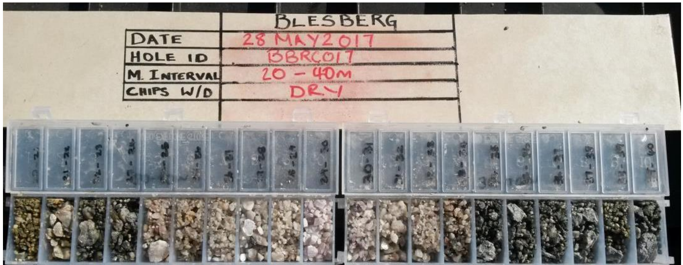
Plate 2. BBRC017 20-40m Chip tray

Drillholes underneath the pegmatite outcrop/subcrop also show a typical split into a northern and southern limb with the northern limb substantially thicker. The distance between the two limbs to the west is also substantially larger than on the hill and is occasionally complemented by a third NW striking pegmatite between the two limbs. Figure 2b above represents a section from drillholes BBRC025 and BBRC027 and Plate 3 shows a chip tray from BBRC025.