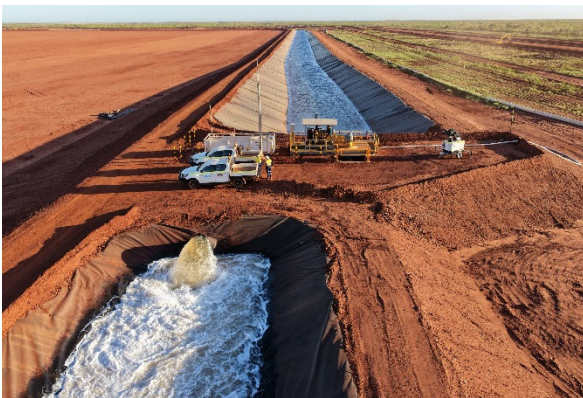
Figure 1: Commissioning of the brine channel

BCI remains on schedule and budget, targeting first salt on ship 1 in the December 2026 quarter.