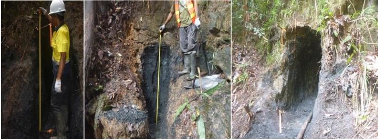
Photo 1: Detail Outcrop Mapping of the Proposed Mine Open Pit –1 in BBM East Block

Detail outcrop mapping of Pit 2 is continuing into the 4 th Quarter 2014.