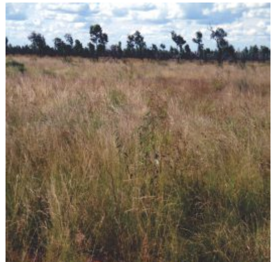
Gunn 1 well pad rehabilitation

With approximately 2,500 PJ of Contingent and Prospective Resources certified in the Gunn Project Area alone, and the remainder of ATP 743P and ATP 744P relatively underexplored, these permits have sufficient reserves potential to contribute significantly towards the gas demands of both the local coal mining industry and the growing LNG industry at Gladstone.