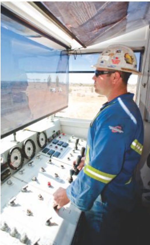
Driller at Driller's Console - Mahalo

It is pleasing to report that, with our joint venture partners, we have now commenced the 12 well exploration and appraisal drilling program at ATP 337P Mahalo. This program will include two 4-spot production pilot projects (at Mahalo and Mira fields) and four step-out core holes. Drilling results have been particularly good from the first four wells drilled in July 2012 in the ATP 337P Mahalo Farm-in Area (the first wells since 2009). This is now being developed into the first production pilot project in this area.