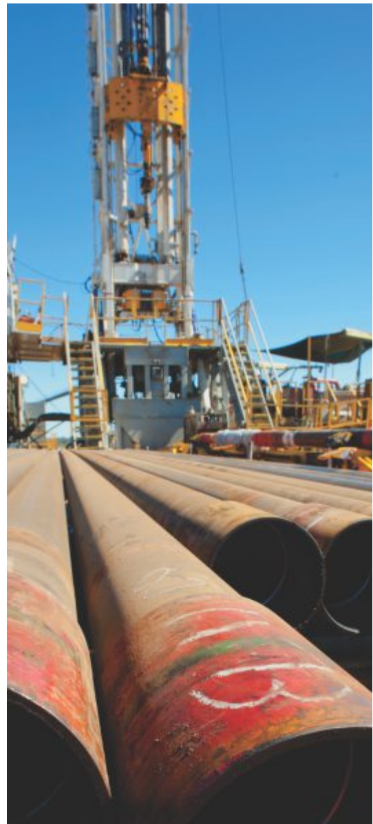
Mahalo pilot well drilling operations

Training is now underway for Comet Ridge personnel and appropriate contractors associated with key components of the safety and environmental systems to ensure consistency of approach. Training is assessed and records maintained within the HSE IT system. Ongoing training will be incorporating effective application of specific procedures.