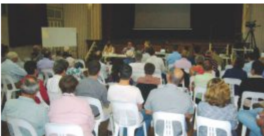
Community Forum meeting attended by Comet Ridge - Barcaldine

Our involvement as a founding member of the Galilee Basin Operators Forum (GBOF) has broadened our exposure to the key stakeholders in the Galilee Basin communities and strengthened our relationships there. The forum, an informal group of coal seam gas exploration companies with petroleum exploration tenements in the Galilee Basin, was formed about two years ago, initially to jointly fund a baseline water assessment for the basin.