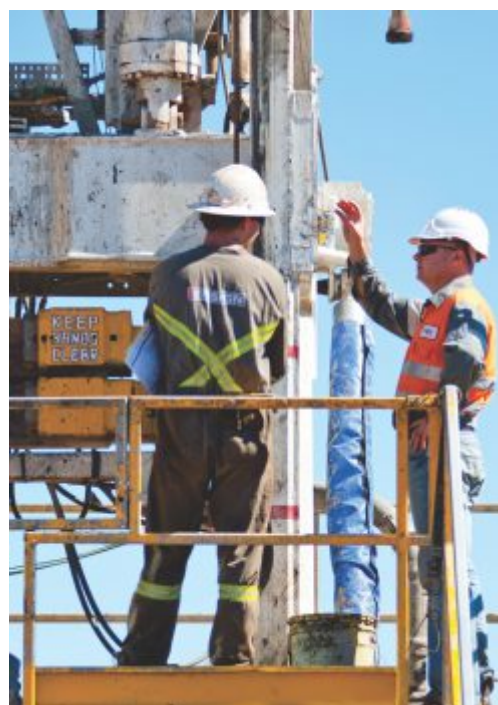
Discussing rig operations - Mahalo

The current work program is focused on maturing Contingent Resources into Certified Reserves across the portfolio during 2013.