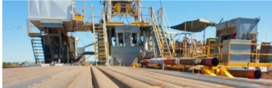
Mahalo pilot well drilling operations