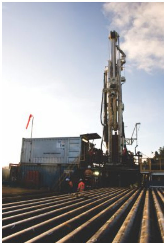
Drilling operations - West Coast NZ

Further progress was made in processing and interpreting the data collected in its recent airborne surveys. Comet Ridge has subsequently updated its geological models, which have been used to identify several new CSG play types. On the South Island, in September 2011, Comet Ridge certified 244 PJ Contingent Resources over the Greymouth Coalfields, the first CSG resources booked on the West Coast of New Zealand.