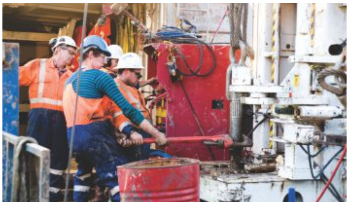
Drilling operations - West Coast NZ