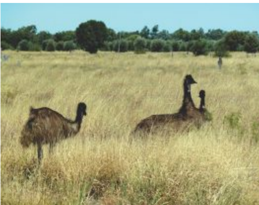
Galilee Basin wildlife

The Managing Director is accountable to the Board of Directors for ensuring this environmental policy is implemented.