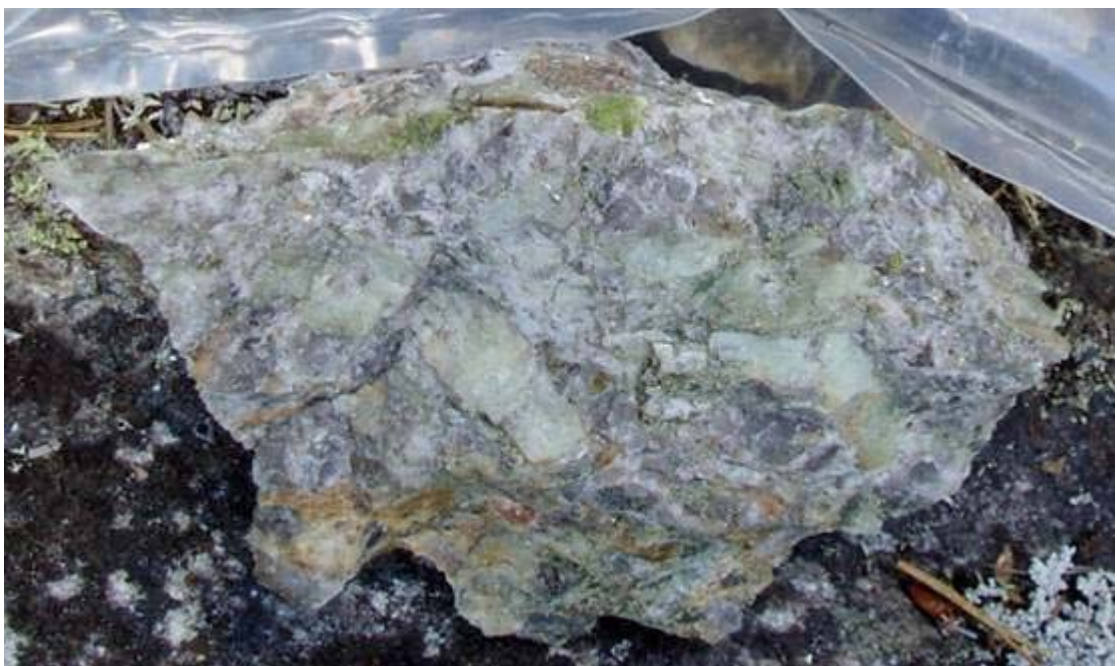
Sample from the Dempster L61 deposit. Spodumene is the pale green elongated striated mineral (sample ~17cm long left to right).