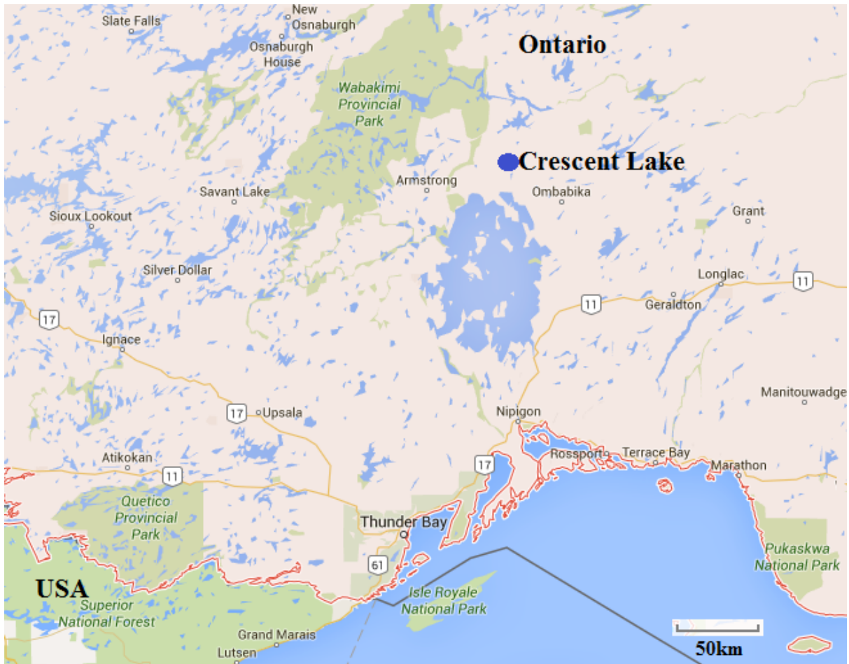
Figure 2: Regional Location, Crescent Lake is situated in the northeast portion of the Sovereign Claims above the four lithium-bearing pegmatite deposits (See Figure 1).