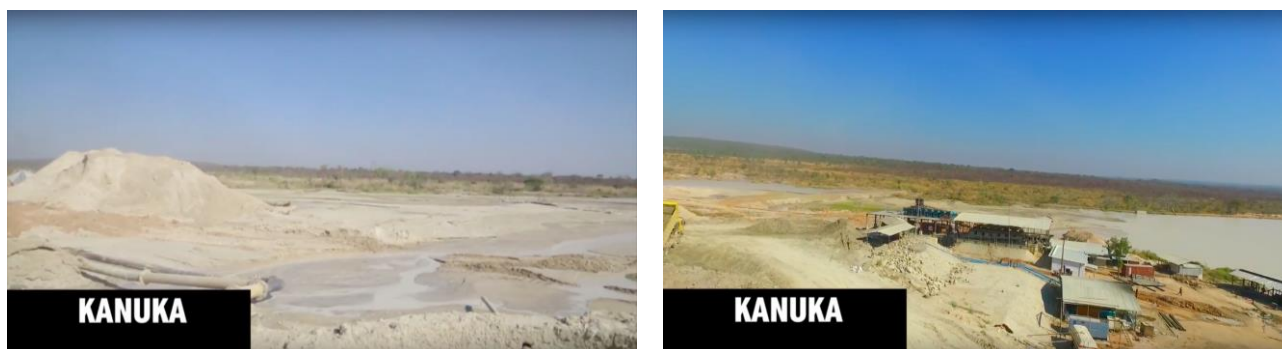
Figure 8 and 9: Mining activity has exposed significant pegmatite exposures on the license areas

Mined material is fed into the recently expanded processing plant which produces tin and tantalum concentrates that MMR exports to the international market. MMR is one of the industry leaders in the DRC, working closely with iTri, and has been instrumental in the on-going success of the program in the DRC, supplying ICGLR-certified conflict free “3T” minerals to the international marketplace.