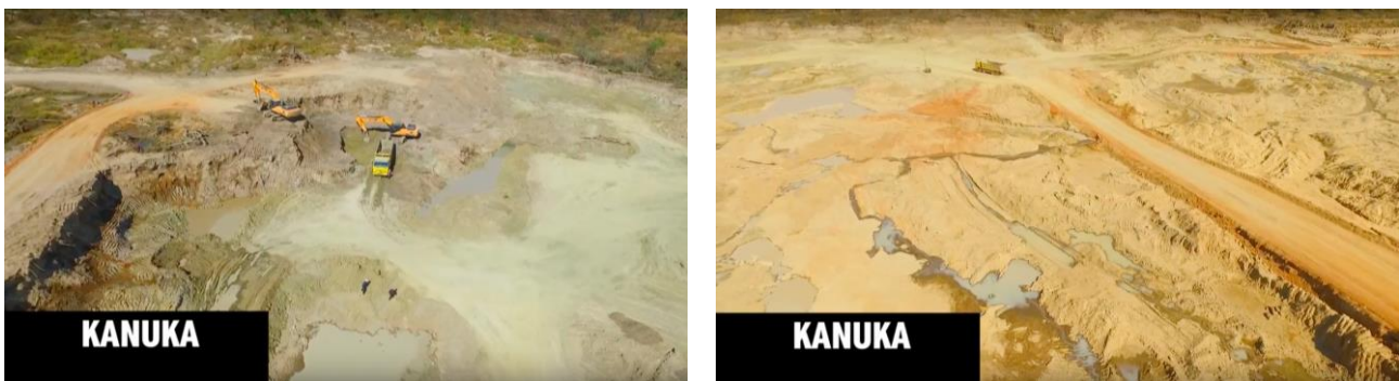
Figure 4 and 5: Current open pit mining activities on PE13082

Conventional open pit mining operations are ongoing on the license areas, with the alluvial sand layers that host the cassiterite and columbite (minerals that are typically coincidental with lithium mineralisation) mined by truck and shovel methods.