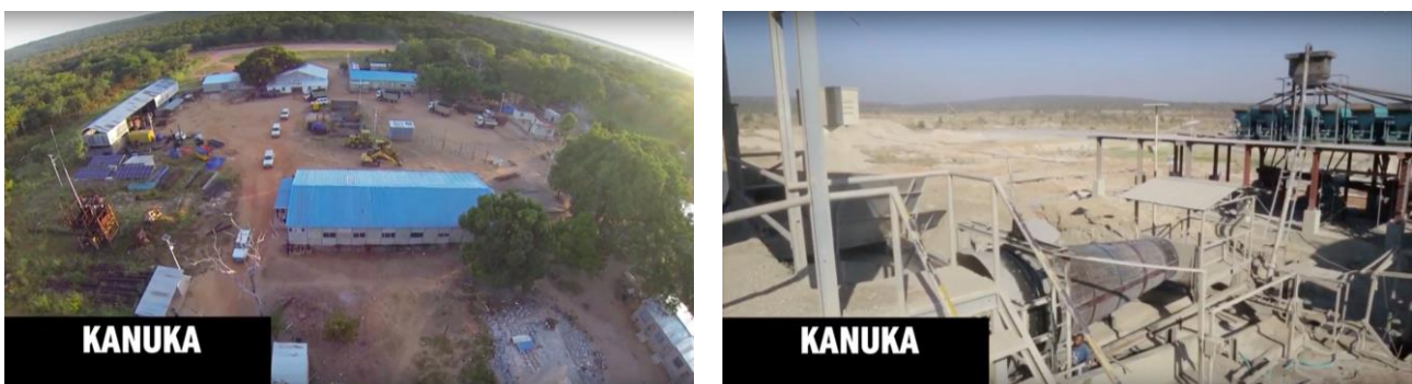
Figure 6 and 7: The site offices and processing plant on PE13082

Current and historic mining in the license areas has exposed a number of pegmatites, with one identified in the current main mining area being in excess of 3kms long and greater than 200 metres in width. This is open along strike on a NE-SW trend and is typical of other pegmatites identified in the region.