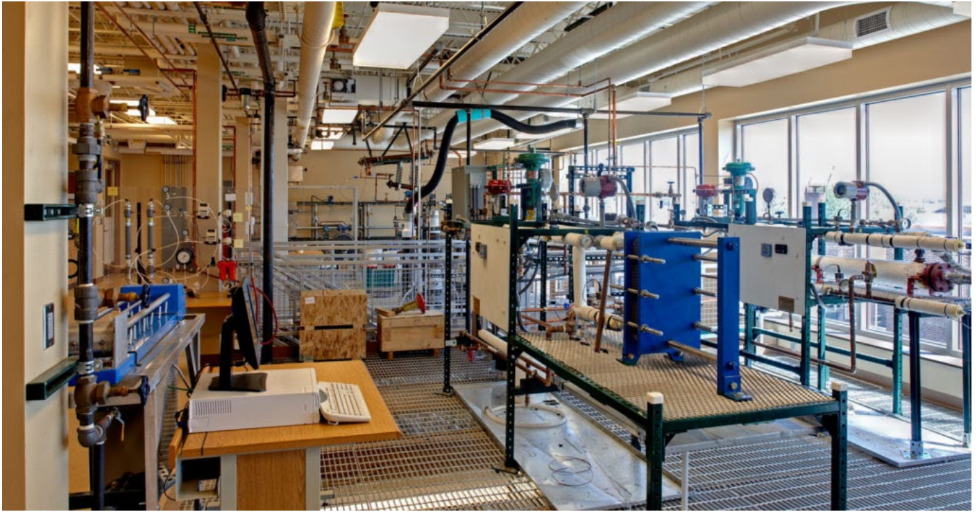
Figure 1 - South Dakota School of Mines & Technology - Chemical & Biological Engineering / Chemistry (CBEC) facilities.