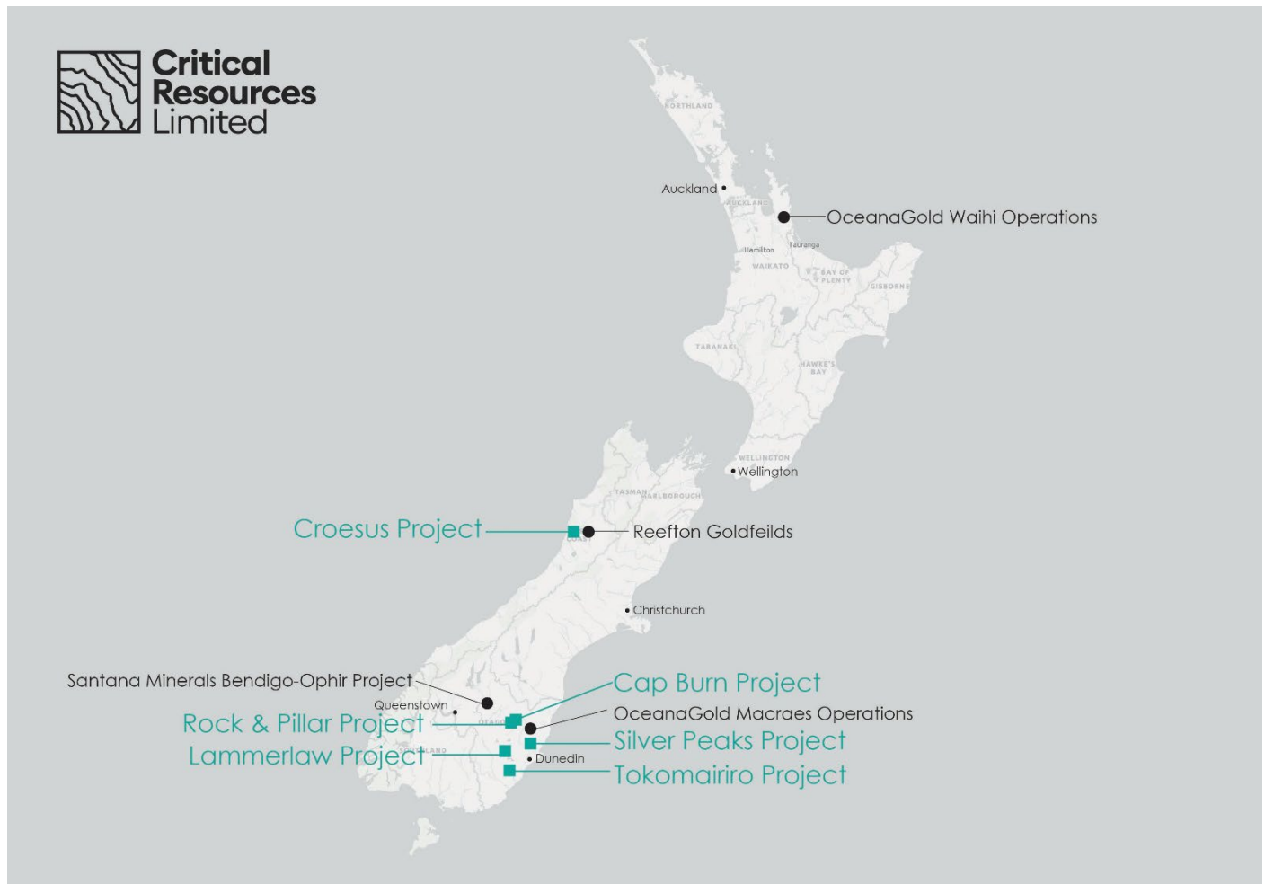
Figure 1 - Location of Critical Resources' New Zealand gold projects with major gold mining projects.

The permit transfer and commencement of field programs mark the transition of both projects from desktop evaluation to active ground-based exploration, and form part of the Company's broader strategy to systematically unlock value across its New Zealand gold and critical minerals portfolio in parallel with the advanced Cap Burn Gold Project.