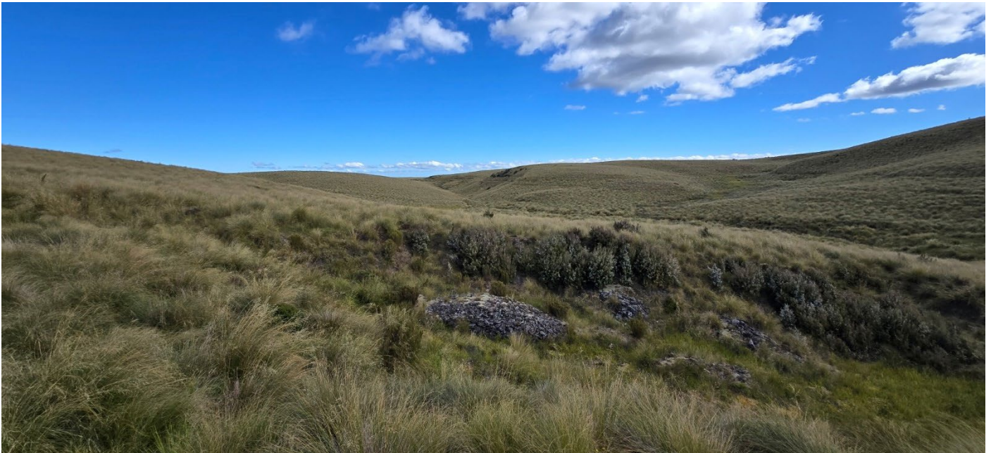
Figure 3 – Lammerlaw - historical alluvial gold-antimony workings within target 2 –Stony creek trend area – looking north.

The interpreted transition boundary between Textural Zone 3 and 4 schists traverses the Lammerlaw permit and represents a regionally significant structural corridor prospective for shear-hosted orogenic gold mineralisation, analogous to the Hyde–Macraes Shear Zone. Structural analysis and field mapping will be used to further define priority target zones along this boundary. Soil geochemistry will be targeted along this boundary.