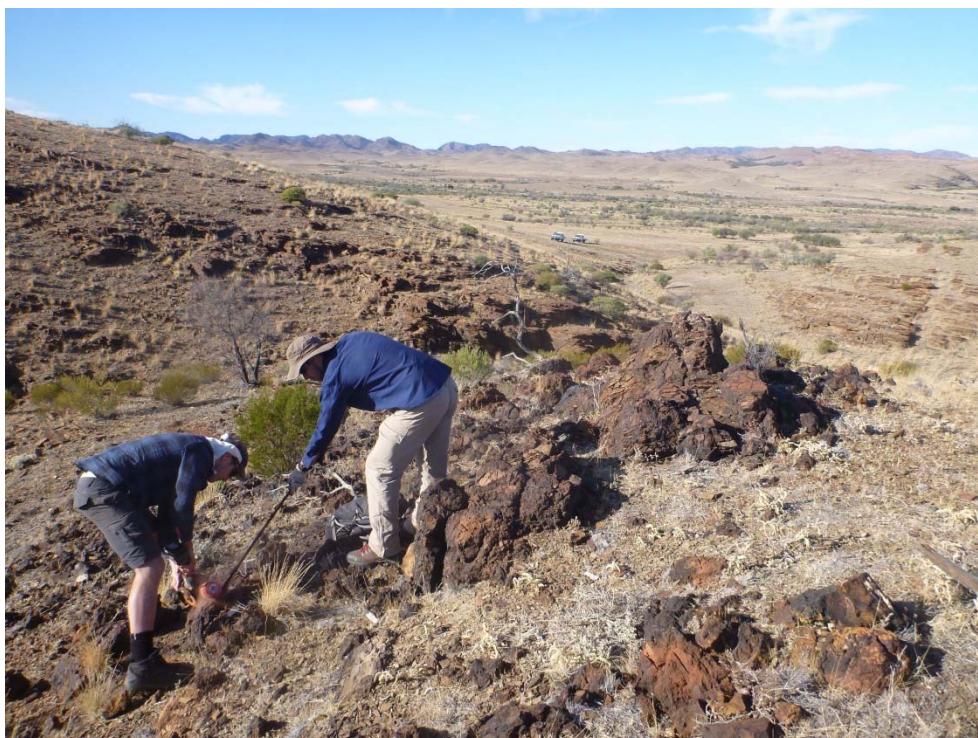
Figure 2. Representative channel sampling of Big Hill gossan material, EL 5105

Core's mapping located and sampled 23 historical mining areas (shafts, drives and trenches) along five separate mineralised faults. To date a total of 118 rock chip samples have been collected from both in situ gossans and mullock heaps adjacent to historic workings (Figure 1). Core is excited by the consistency of grade and scale of the mineralisation identified thus far at the project.