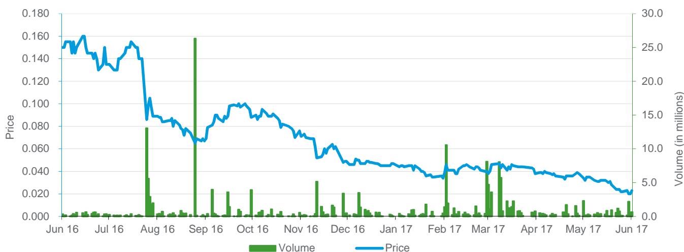
Figure 2 DCC Share price performance

8.10 The figure below sets out a summary of DigitalX's closing Share prices and traded volumes in the 12 months to 1 June 2017, representing the last day the Company's Shares were traded prior to entering a trading halt in advance of the Company's announcement of the Proposed Transaction.