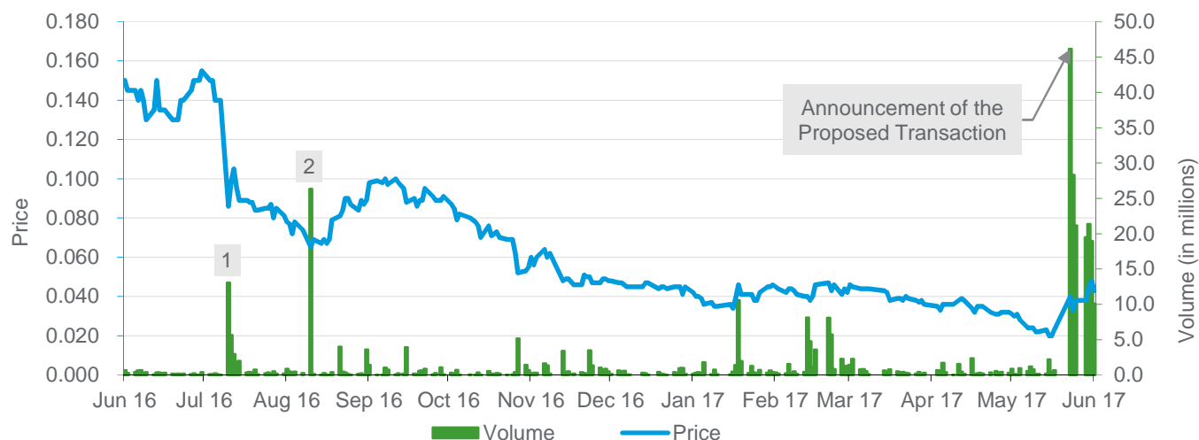
Figure 1 DCC Share price performance

5.21 The figure below sets out a summary of DigitalX's closing share prices and traded volumes for the 12 months to 16 June 2017.