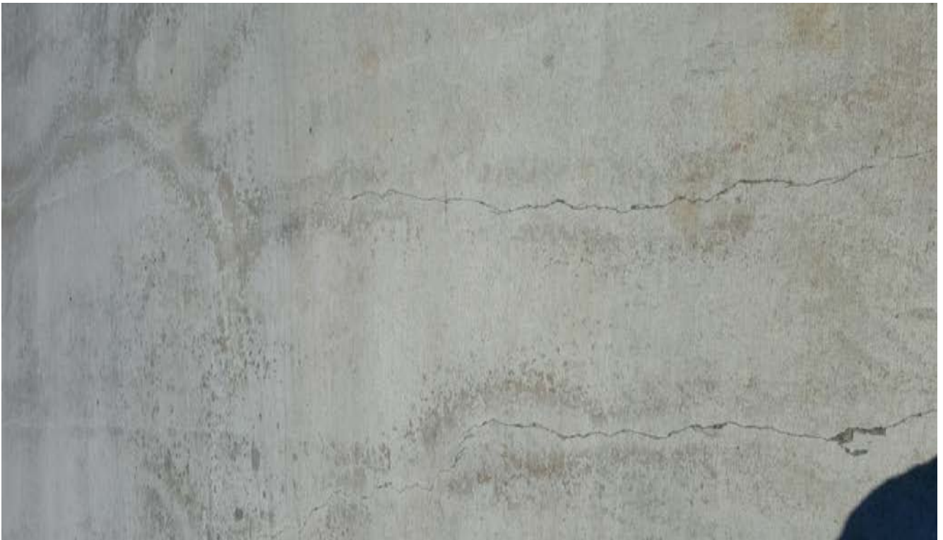
Figure 5. Control Slab Showing Cracking After 6 Months...the EdenCrete™ Slab Showed No Cracking After 6 Months

The uncracked I-20 EdenCrete™ slab, after 11 months at a location on the I-20 where the concrete regularly cracks in a very short time due to the very difficult ground conditions, follows the highly encouraging laboratory tests carried out on test cylinders of the concrete used in the I-20 Field Trial.