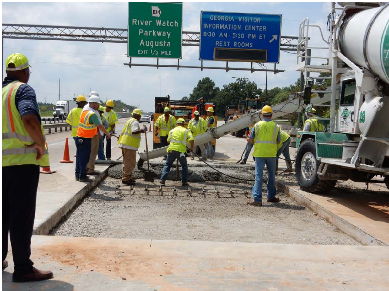
Figure 1. EdenCrete™ Slab being laid on I-20 in Augusta, Georgia on 27 August 2015

Eden Energy Limited (ASX: EDE) is pleased to announce a recent visual examination of the current state of repair of the EdenCrete™ enriched section of concrete laid on 26 August 2015 as a field trial of EdenCrete™ on a troublesome section of the Interstate Highway I-20 in Augusta, Georgia for the Georgia Department of Transportation (“GDOT”) (see Eden ASX Announcement ASX: EDE 27 August 2015 and Figure 1 below ) is showing no visible cracking or significant signs of wear after 11 months of highway wear (see Figure 2 below ).