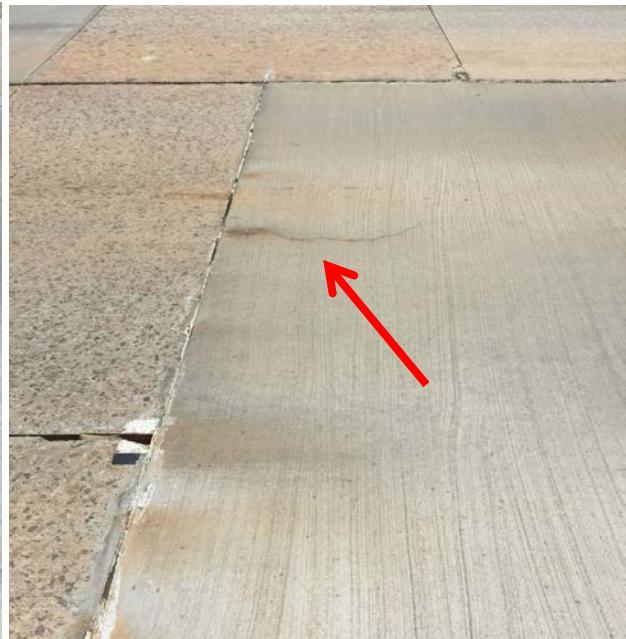
Figure 2. EdenCrete™ - No Visible Cracking