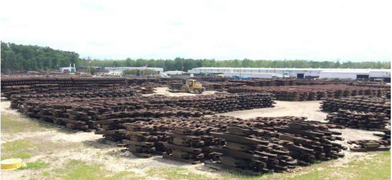
Figure 4. Site of Field Trial Showing Extreme Loading, Heavy Duty and Abrasion

This result from the EdenCrete™ I-20 Field Trial mirrors a similar result in a commercial field trial in October 2015 (see Eden ASX announcement ASX:EDE 1 April 2016 ) where, in a six months' field trial of EdenCrete™ using of the same GDOT 24 Hour Repair Concrete Mix in an application that is subject to extreme wear and abrasion (see Figure 4 ), no cracking or visible wear was evident. However, there was significant cracking and visible wear in the control slab (see Figure 5 ) within the same 6 months period. As a result, EdenCrete™ was then selected for used in a subsequent commercial replacement programme at the site.