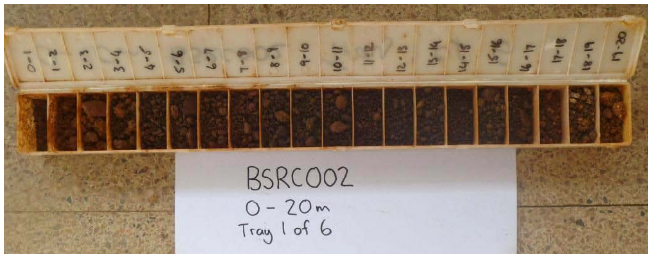
Figure 5. BSRC002, goethite / hematite rich iron formation interval of 14m @ 41.96% Fe from 2 to 16m