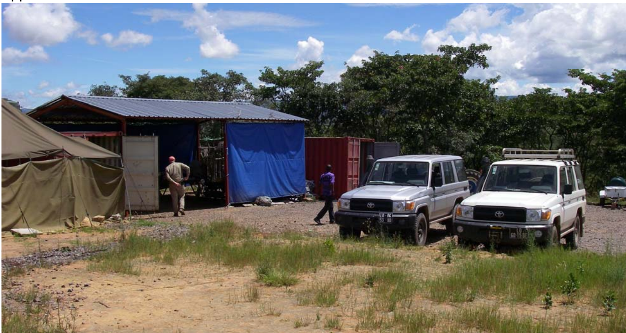
Figure 1: Campsite facilities at the Longonjo project