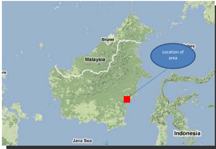
Location Map (Note the area depicted is not to scale)

The concession is located north of Balikpapan, and can be accessed by land road from “Balikpapan Bay” in the south. The distance to the coast is approximately 50KM for shipping. The results of NDL’s geological surface mapping on both properties conclude that there is a significant appearance of coal outcrops and continuity of identified coal seams. This coal project justifies more intensive exploration and scout drilling to delineate additional seams and confirm coal continuity both along strike and down dip.