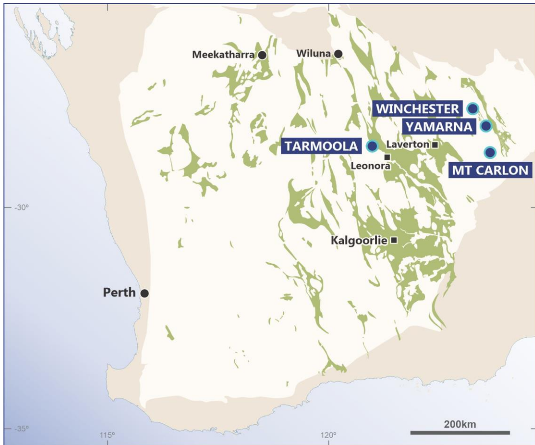
FIGURE 1: GREAT BOULDER PROJECTS

Great Boulder is a mineral exploration company with projects in the Eastern Goldfields region of Western Australia. With a focus on base metals and gold, the Company's main focus is exploration for copper-nickel-cobalt sulphide mineralisation. With advanced projects including Mt Venn and Winchester in the Yamarna Belt and the backing of a strong technical team, the Company is well positioned for future success.