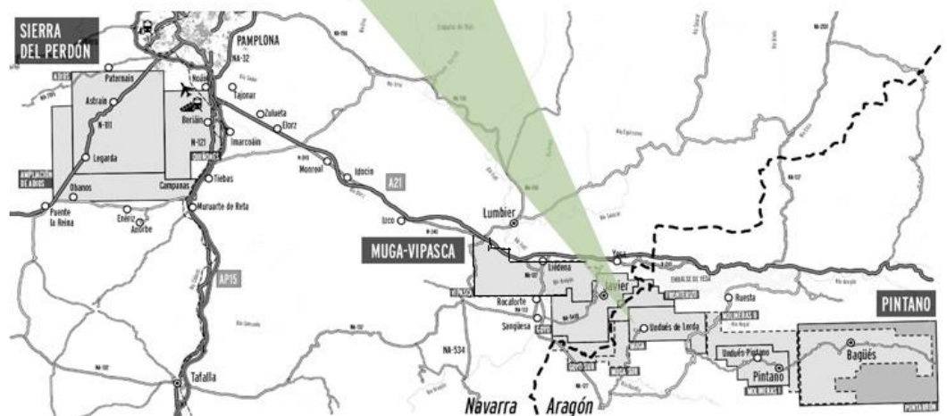
Figure 1: Location of Iberdrola’s Rocaforte substation in relation to Highfield’s proposed Muga Mine Installation