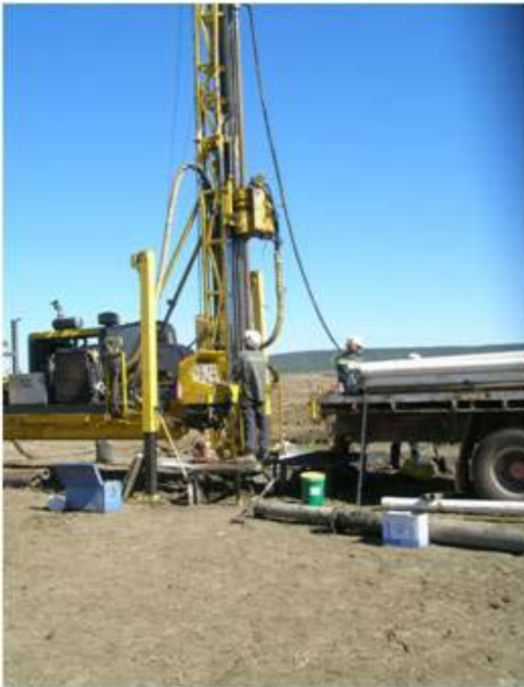
Figure 1: Drilling Rig at EPC1394 Hughenden Coal Project, July 2