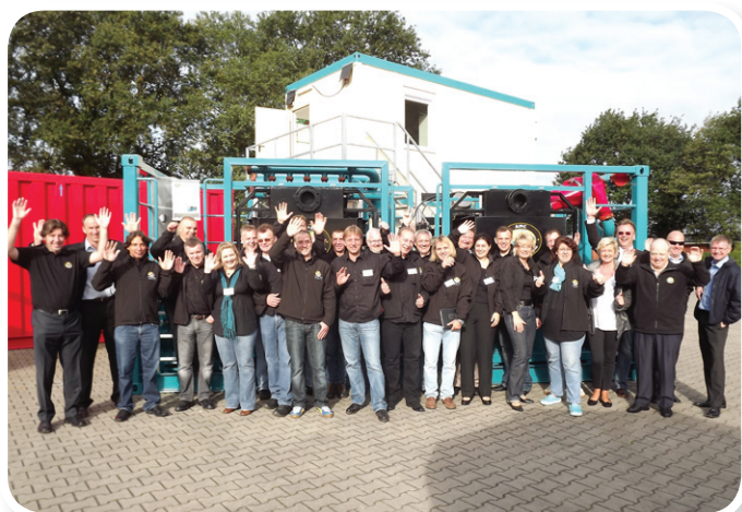
AMC Europe at the open day in Germany

The event drew approximately 100 guests from the European oil and gas industry, including representatives from many major companies. Supported by senior management, the open day provided guests with the opportunity to see the full range of products and services on offer from AMC Oil & Gas Europe. State-of-the-art computer controlled centrifuges and customised mixing systems were focal points for visitors.