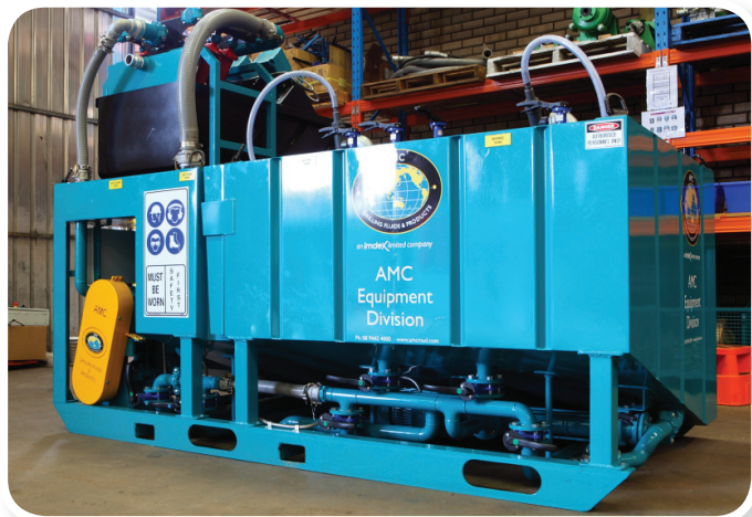
AMC Solids Control Unit

With Imdex's solids control unit technologies, the existence of drilling fluid sumps beside the drilling rig in diamond drilling applications will become a thing of the past. The major mining companies and major drilling contractors are willing to embrace the new technology once it is 100% commercial. Demand for this new technology is high and increasing further. When developing new technology, setbacks are encountered and our solids control technology is no exception. However, the development work and testing is in the final stages for the surface unit and we are optimistic of having this technology ready for the market in 2H12. Unfortunately, this will be too late to have a material effect on the Company's earnings for FY12, however, should contribute meaningfully in FY13 and beyond.