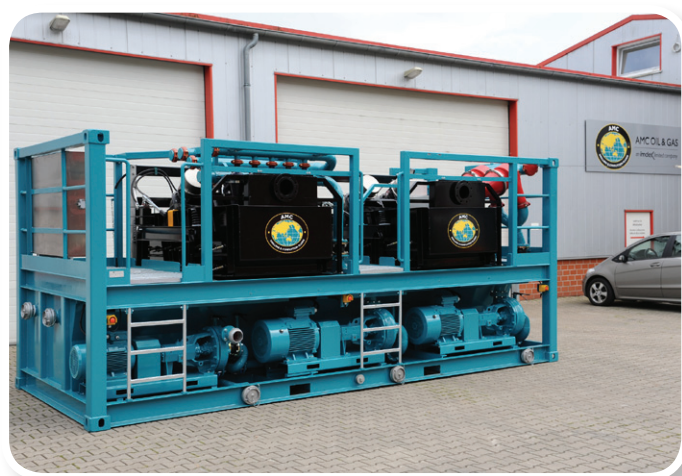
AMC Oil & Gas Europe recycling unit I500R