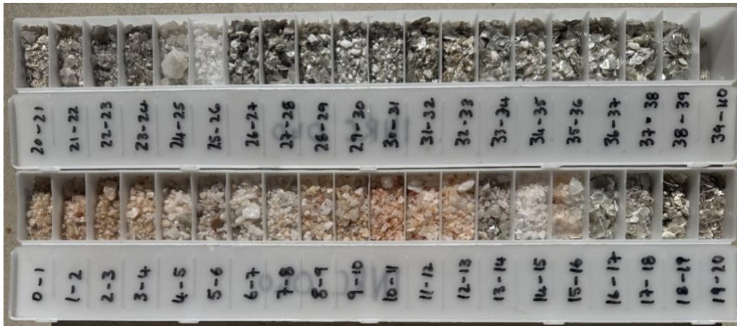
Plate 2: RC chips showing mica (grey, 16 to 25m and 26 to 39m), with quartz (white 0 to 16m and 24-26m)

The Target is based on the interpreted pegmatite volume within mining lease M45/258 and within approximately 90 m of surface (Figure 2), excluding areas already classified as Inferred Resources. Geological modelling indicates the pegmatite extends over 1,000–1,200 m in length, 200–300 m in width, and up to ~150 m in depth, yielding a total conceptual volume exceeding 150Mt.