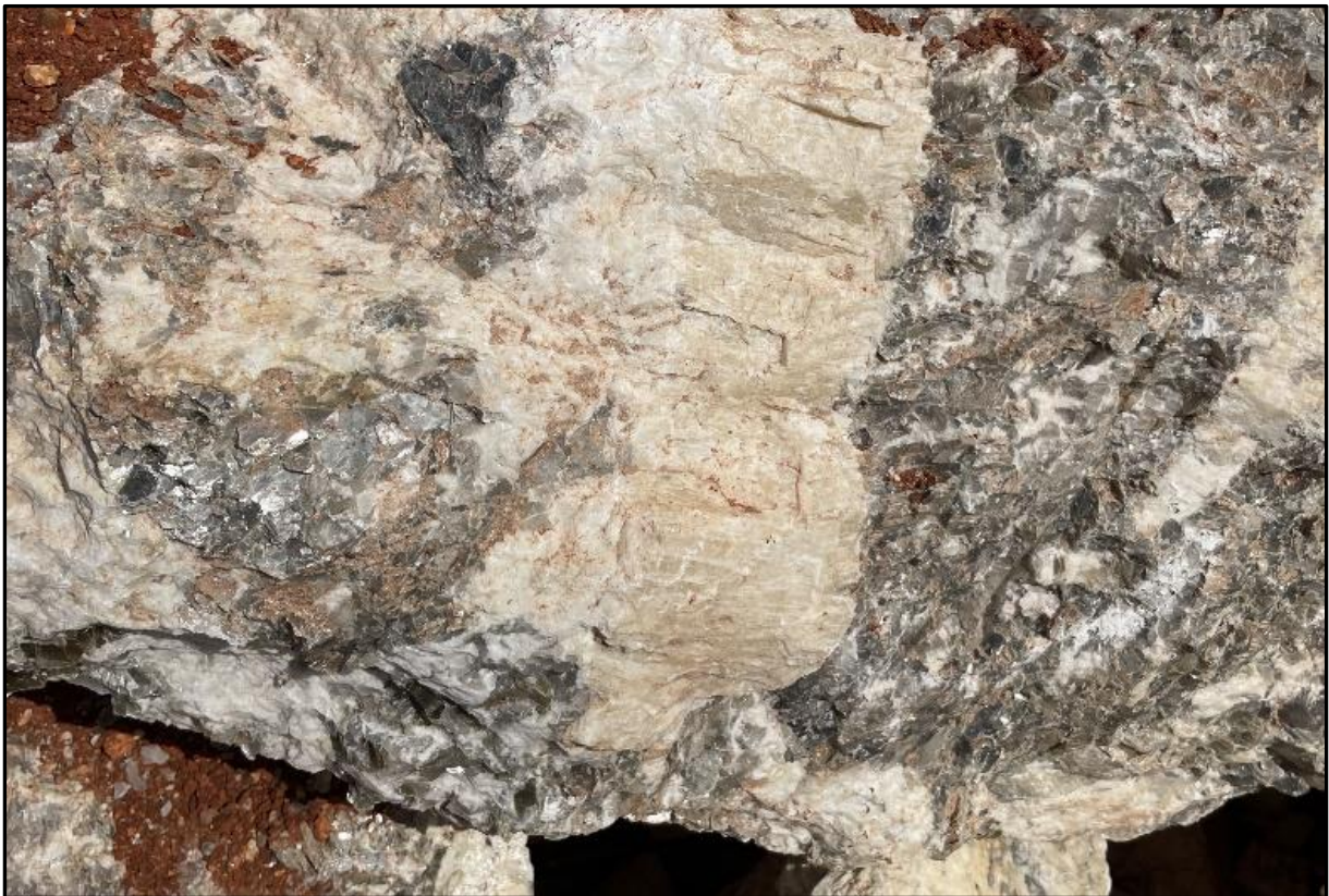
Plate 1: Hand specimen showing flake mica (grey), with potassium feldspar (cream), albite (white) and quartz (grey)

To date, Industrial Minerals' laboratory assays have focused primarily on lithium and silica potential; nevertheless, geological logging has consistently been used to define the extent of quarrying limits and to guide future exploration.