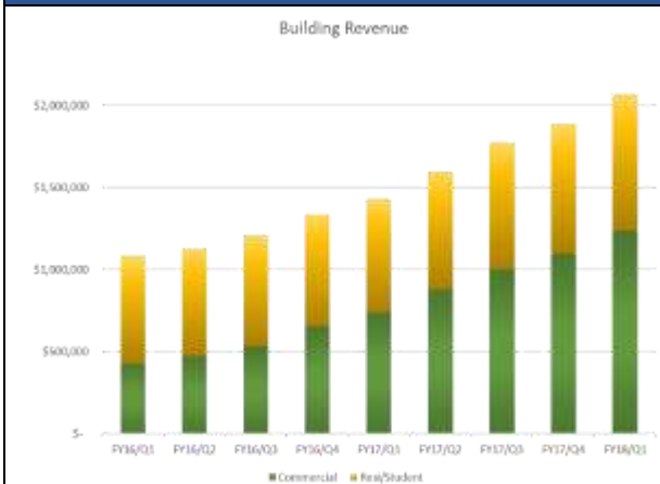
Figure 1: 9 Consecutive Qtrs of growth