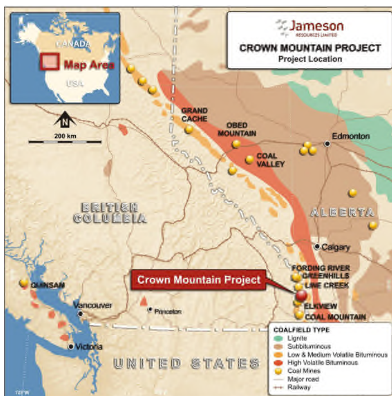
Figure 1: Project location

The Project is located within the Elk Valley Coalfields in the southeast corner of British Columbia, Canada and includes two coal licences covering an area of approximately 1,260 hectares. The Elk Valley is host to some of Canada's major coking coal mines including Elkview, Line Creek, Fording River and Green Hills. (Figure 1) The project is situated in a well-developed area with access to ample infrastructure, and located only 30km by road from the town of Sparwood. The Canadian Pacific railway line which connects to West Shore and Ridley coal terminals, is located just 15km by road.