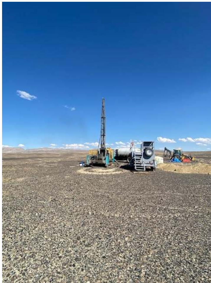
Figure 1. Diamond drill rig at Clayton North

Jindalee Resources Limited ( Jindalee , the Company ) is pleased to announce drilling has commenced at its 100% owned Clayton North project located in Nevada, US (Figure 1). The program is designed to follow up anomalous lithium results from surface sampling undertaken by Jindalee in 2018 where results of up to 930ppm Li were detected at surface 1 .