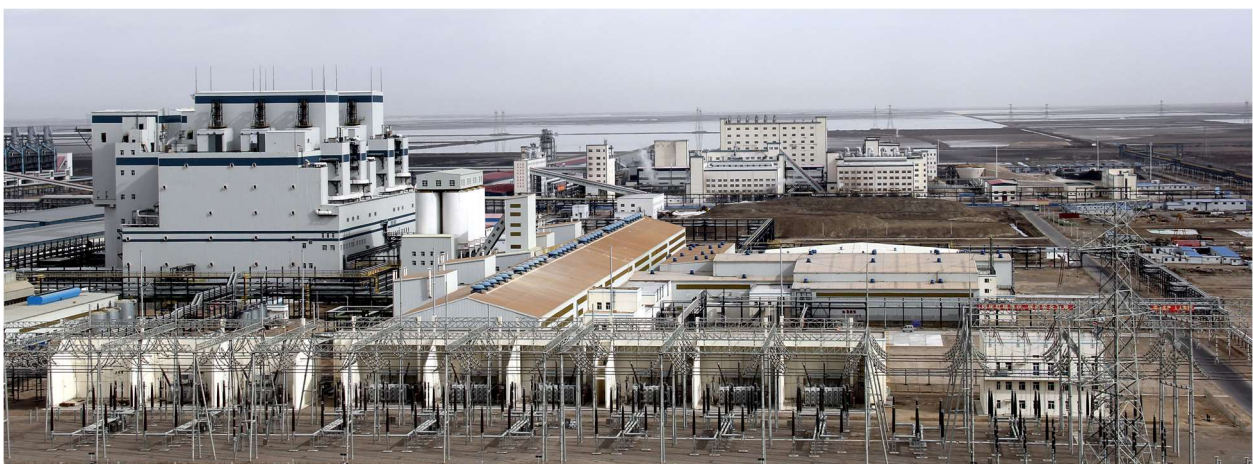
Picture: Qinghai Salt Lake Magnesium Co. Ltd electrolytic magnesium project at Golmud in Qinghai Province PRC. The Magontec Qinghai magnesium alloy cast house is part of this complex.

To view the FY2018 Magontec Limited Annual Report and for more information on Magontec Limited please visit our website at www.magontec.com