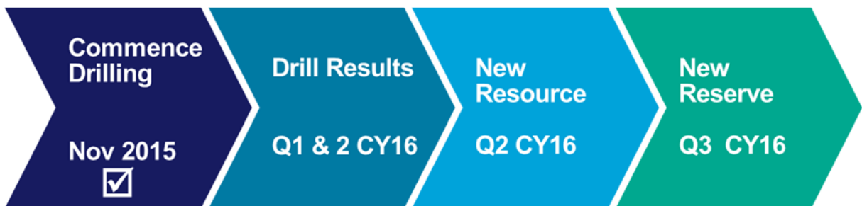
Figure 3. Exploration milestones

The RC and diamond drilling program is aimed at extending the open pitable minelife through the extension to and in-fill drilling of existing deposits, as well as the definition of new resources from outcropping pegmatite prospects on lithium rights acquired from Metals X Ltd in July 2015.