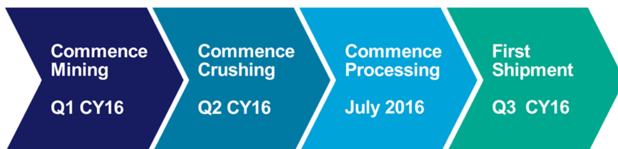
Figure 1. Project milestones

Mt Marion is a globally significant lithium deposit, containing total Indicated and Inferred Mineral Resources of 23.24Mt at 1.39% Li 2 O and 1.43% Fe 2 O 3 , at a cut-off grade of 0% Li 2 O (Appendix B). The project has a granted Mining Proposal and received its Works Approval for plant construction, on the 18 th of December 2014.