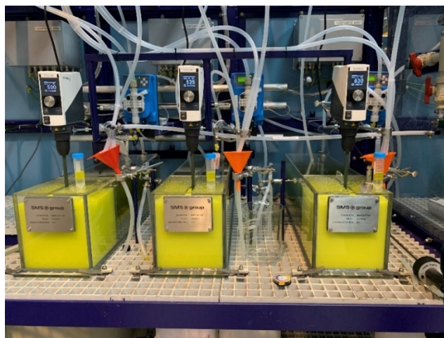
Figure 4 - Refining circuit – lithium extraction