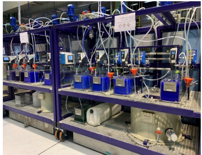
Figure 3 - Refining circuit – cobalt extraction