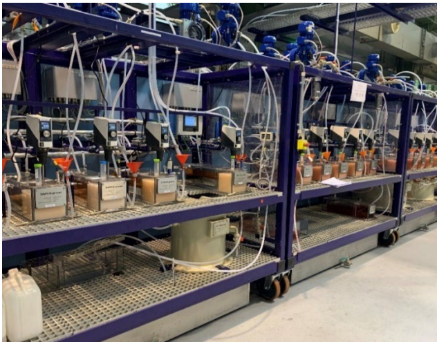
Figure 2 – Refining circuit – nickel extraction