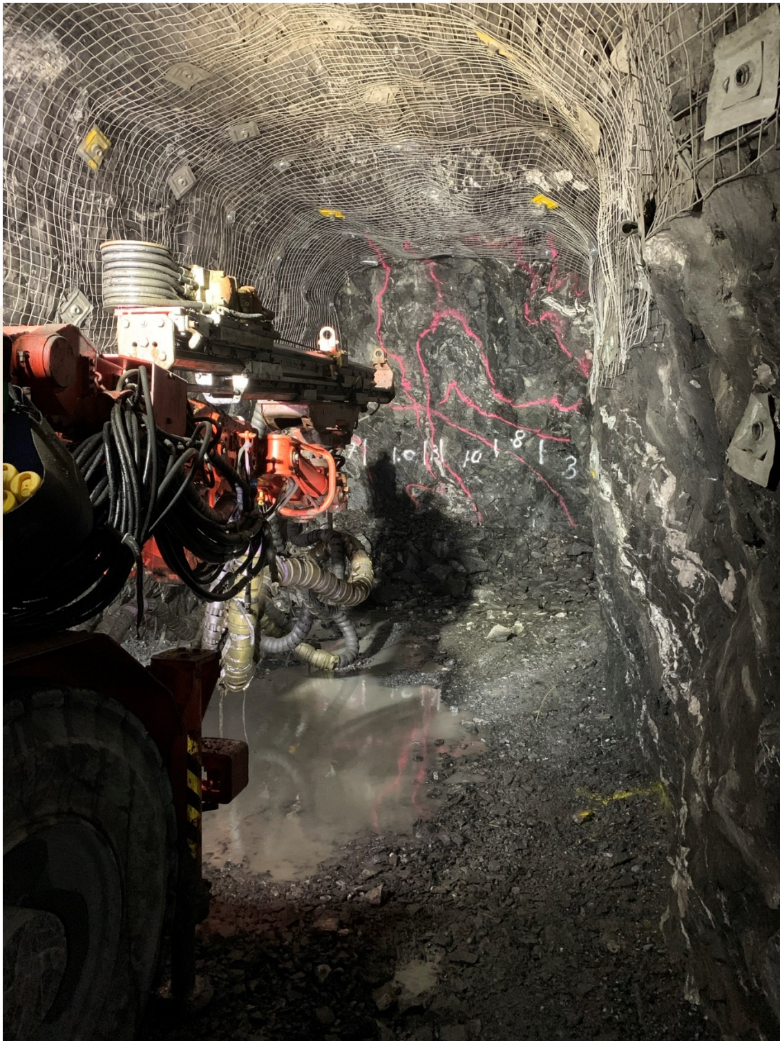
Ore drive underground at Golden Eagle

The Company is currently conducting work at both Makai and Riverina to assess the opportunity to add further underground production to our mine schedule. Makai is located adjacent to the historic Lights of Israel mine and less than 1km from the Davyhurst plant.