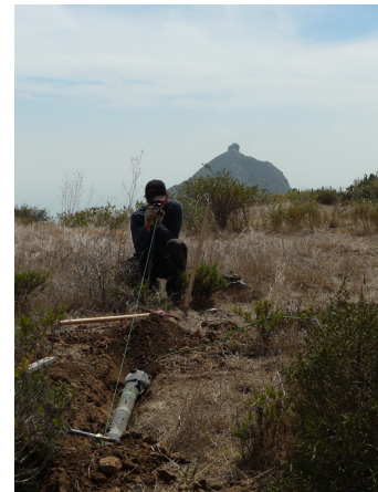
Petratherm and Barcelona University Staff, performing magneto-telluric measurements on the Island of Tenerife