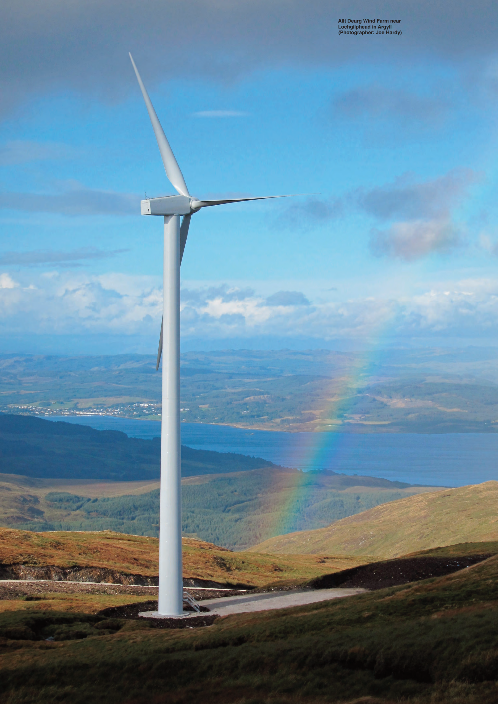
Allt Dearg Wind Farm near Lochgilphead in Argyll