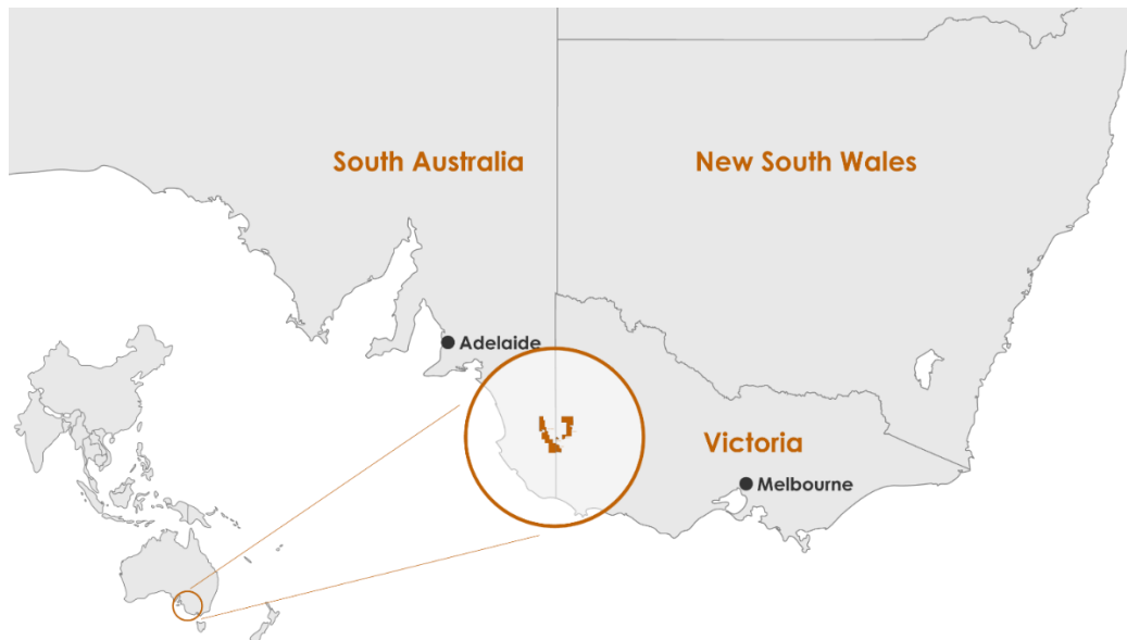
Figure 2: Mitre Hill Project Location Map