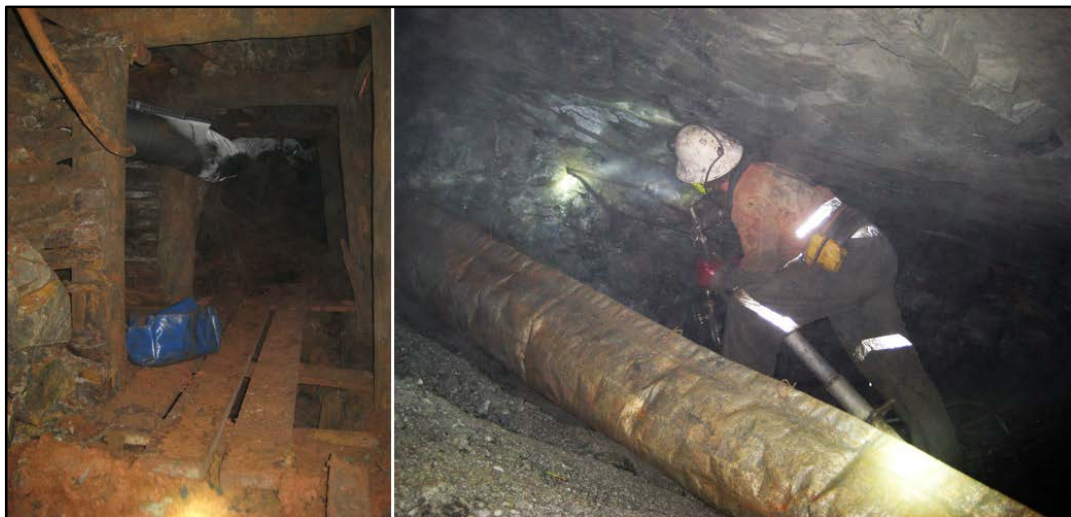
9 Level Underlay shaft crossover

This has allowed REZ to commence mining of bulk sample locations. Development is now well underway on a 29-metre scraper drive linking the southern edge of historic stoping on the 9 Level to an ore chute adjacent to the 10 Level shaft.