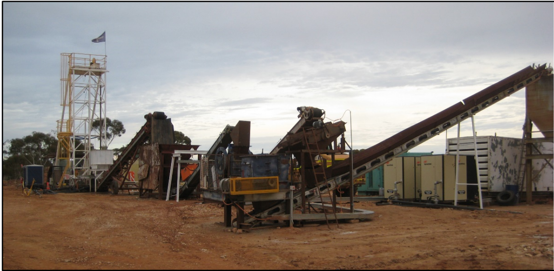
Radio crushing circuit