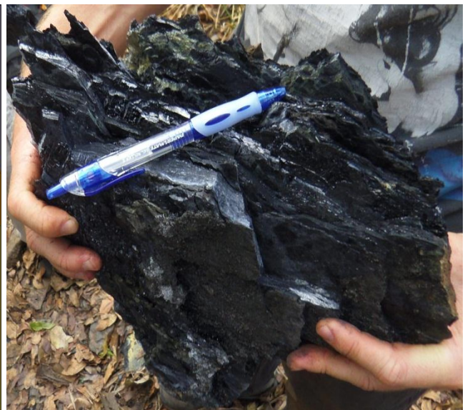
Coal from outcrop on PL 7051/2011

The outcrop is located within a sequence of carbonaceous mudstone and interbedded sandstone and is interpreted to lie in the same stratigraphic position as the adjacent Ngaka mine and Katewaka/Mchuchuma coal occurrences within the same basin.