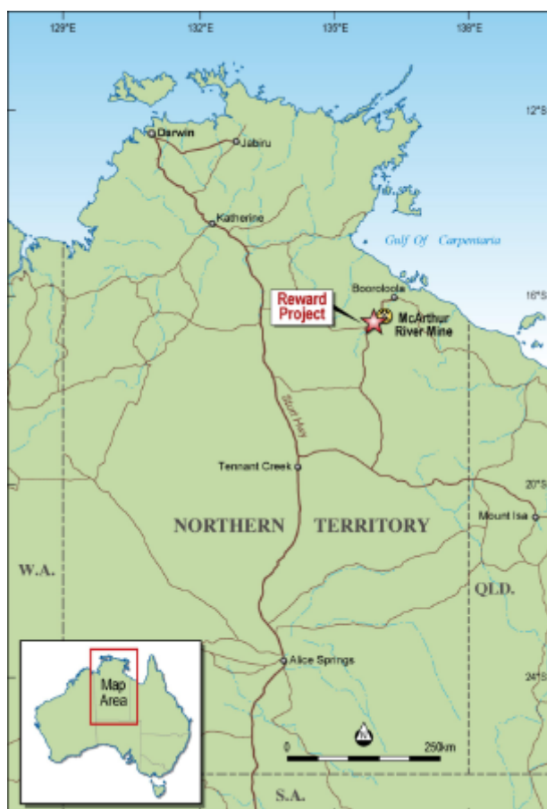
Figure 1: Reward Project location