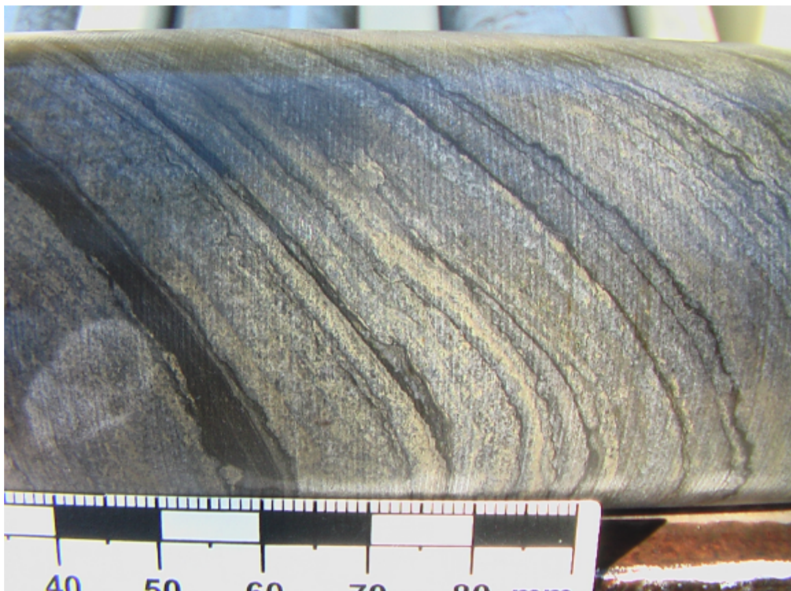
Figure 4: MY16, 189.1 metres depth, showing banded sphalerite (light yellow colour). Scale is in millimetres.