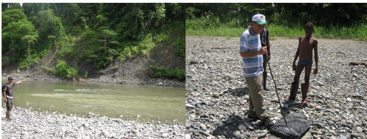
Eureka: the Coal seam on other side of the river and the young swimmer who retrieved a coal sample for lab analysis