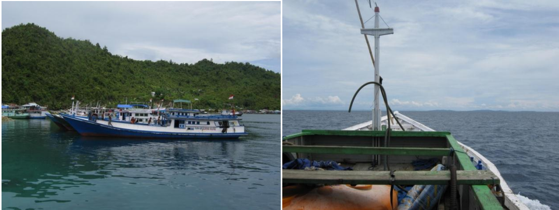
Inter-Island Ferry from main town (Satui), Yapen Isld to Warren on Papua