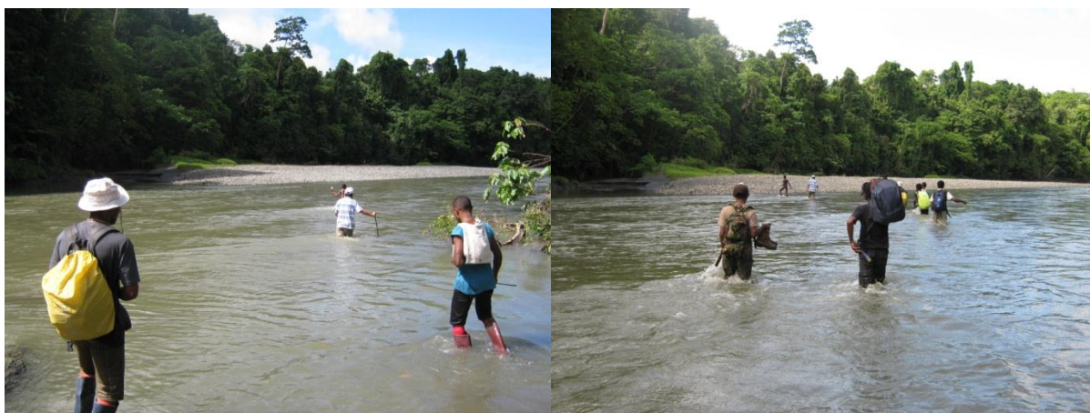
Much wading is unavoidable and the “powder” has to be kept dry