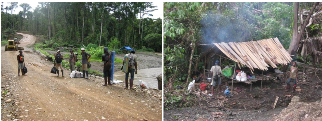
Time to start walking along the river bank and build camp sites