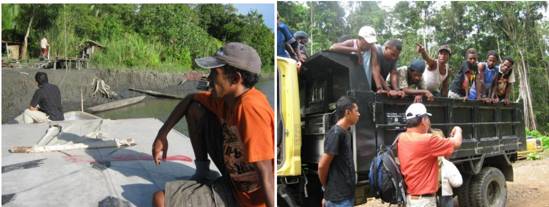
Coastal small ferry to drop off point for truck transport up river road