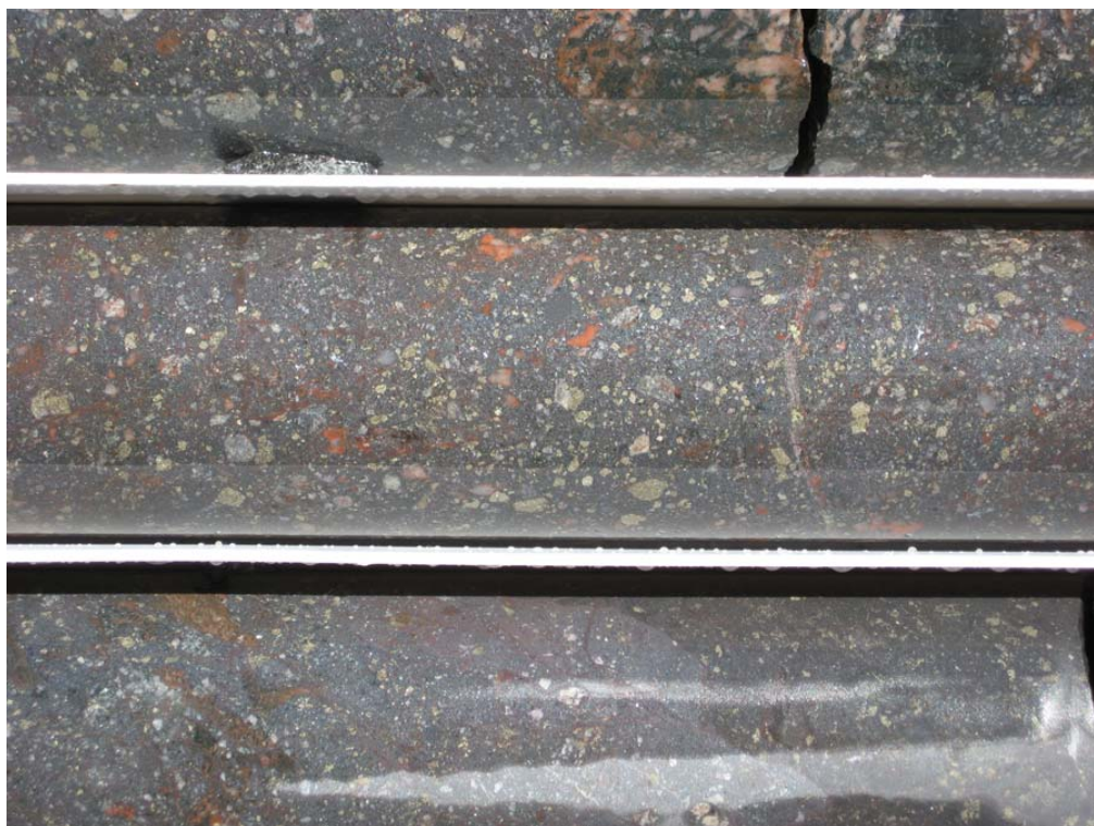
Figure 2: Close-up photo of typical hematite breccia from VUD 7. Hematite is dark grey, sulphides (pyrite and chalcopyrite) are yellow/silverish and the other minerals are carbonate (probably siderite), quartz and feldspar. (NQ Core – approx. 50mm diameter).