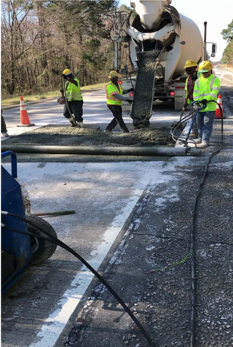
Figure 1 – Replacing sections of concrete shoulder on I-16 Interstate Highway with EdenCrete® enriched concrete

Work has now commenced on the first commercial GDOT project involving the use of EdenCrete® (as previously announced EDE: ASX 9 and 13 February 2017) in the GDOT 24 hour repair mix. The project involves replacing sections of the shoulder alongside the I-16 Interstate Highway (see Figure 1) and involves the replacement of approximately 1,000 cubic yards of concrete enriched with EdenCrete® (equivalent to approximately 125 standard concrete truck loads of concrete).