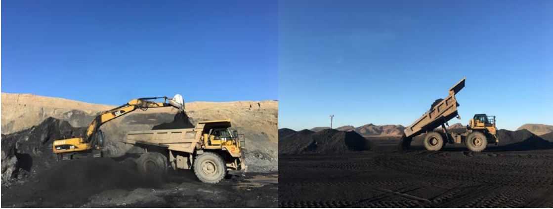
Images: Coal mined and delivered to ROM stockpile at BNU Hard Coking Coal Mine