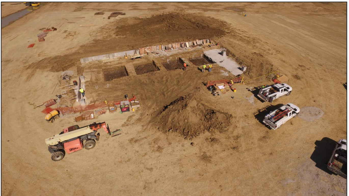
Preparing Foundations at the Preparation Plant at Poplar Grove Mine