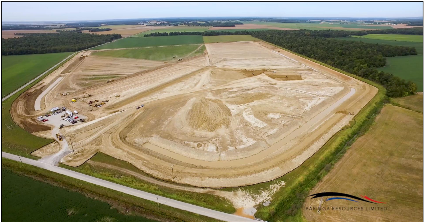
Mine Site Excavation and Development Continues at Poplar Grove Mine