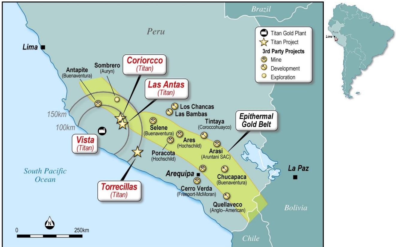
Figure 2 | Location map – Titan project within trucking distance of the Company’s Vista gold processing facility.