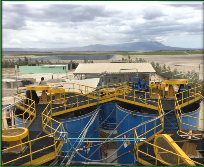
Figures 1 | Vista Gold Plant – Leach Tanks for gold recovery

In the 6-month period ending June 2019 the Company produced 1,962 ounces continues to source ore from licensed miners in the region and the supply chain for mineralised material for the gold toll treatment arm of the Company has successfully been consolidated to a single location. Focus of the ore purchasing and processing.