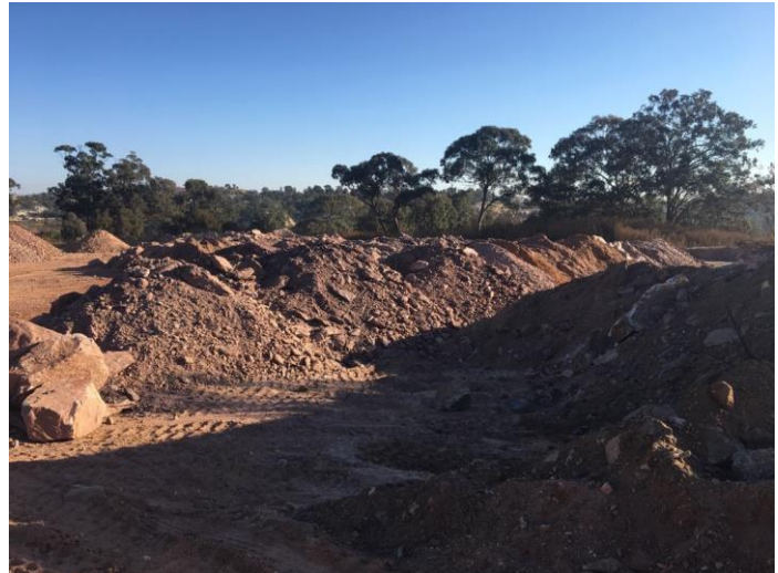
Figure 4. Stockpiled SPP ore ready for shipment

Since the quarters end West Wits announced it has executed a term sheet with Sibanye Gold Limited (“Sibanye”) for the processing of reef material through the Ezulwini Gold Process Plant. Under the agreement West Wits will truck ore from SPP to the nearby Ezulwini plant approx. 40kms away. The Company was delighted with the outcome as it had assessed a number of proposals. Whilst it has taken a number of months to be executed, to now have a company of Sibanye’s industry standing processing West Wits ore is an excellent result.