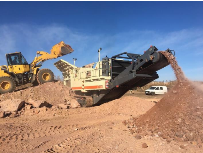
Figure 3. SPP ore being fed into mobile crusher