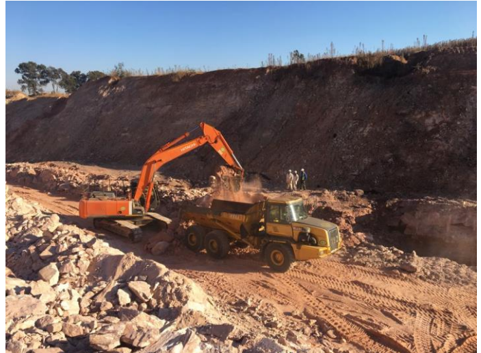
Figure 2. Ore being removed from Pit 1