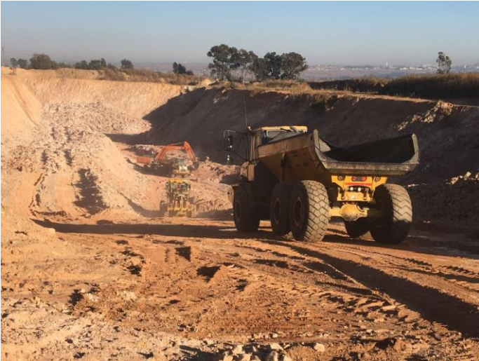
Figure 1. Truck entering pit 1 at SPP

Following engagement of ALS operations recommenced at SPP on 20 June. Since recommencement over 7,400 tonnes of ore have been extracted, put through a primary crusher and then stockpiled pending completion of a new processing agreement. From a standing start the production rate for this month is nearing a higher monthly production than the Company achieved within any month under its previous arrangements.