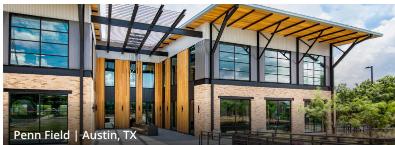
Penn Field | Austin, TX