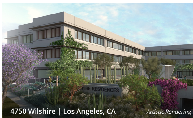
4750 Wilshire | Los Angeles, CA